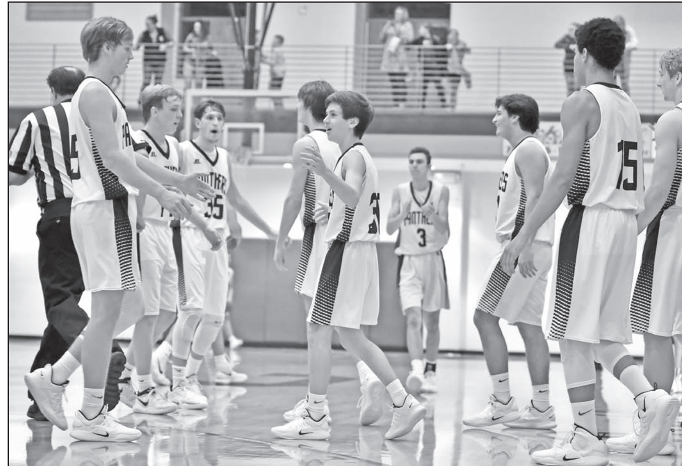
Union County players breathe a sigh of relief after surviving a late haymaker from Towns County that nearly floored the Panthers, who led by double-digits with under two minutes remaining. Union has now won 41 of the last 44 games vs Towns.

The Rebels are currently 1-1 with a 59-54 win over Pickens County -- whose football team was eliminated the night before -- and a 42-40 loss to rival Gilmer.